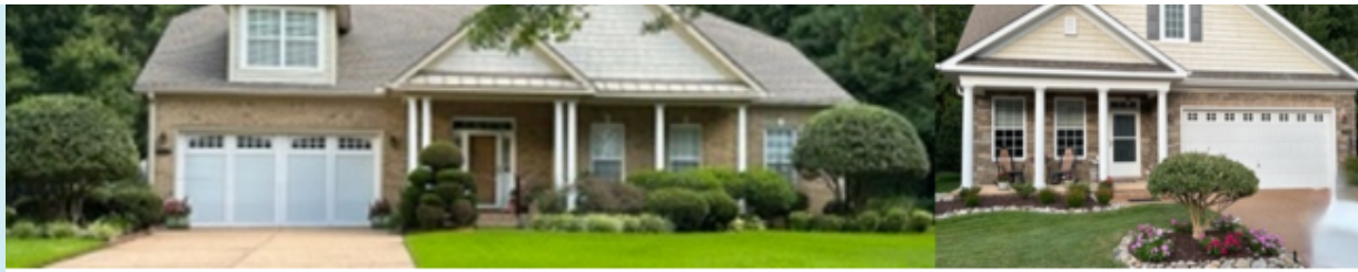
Aurora & Peter Aquintay 3124 Genius Drive, The Grove